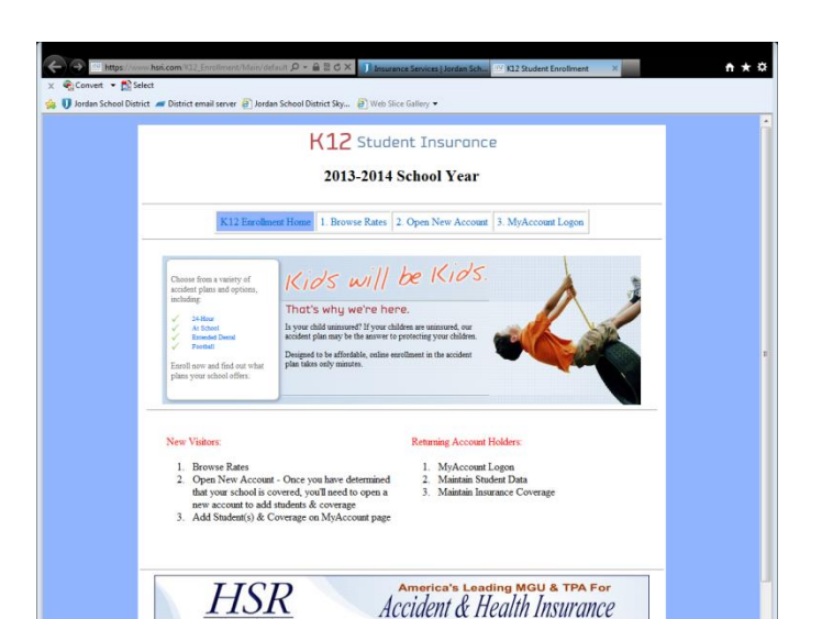
Step 1: Log onto www.hsri.com/K12 enrollment