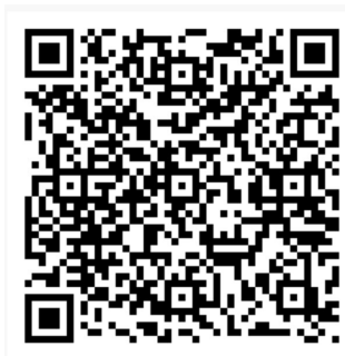
Open House Flyer